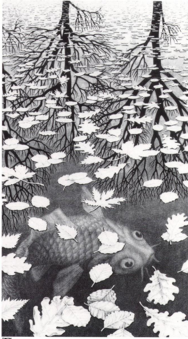
Three Worlds, M. C. Escher