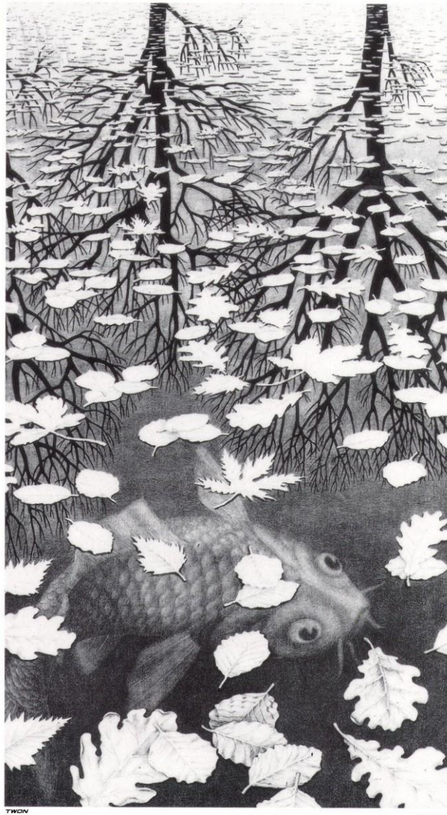
Three Worlds, M. C. Escher

18. You may wish to choose a topic not listed here. If so, you must obtain prior approval from your instructor.