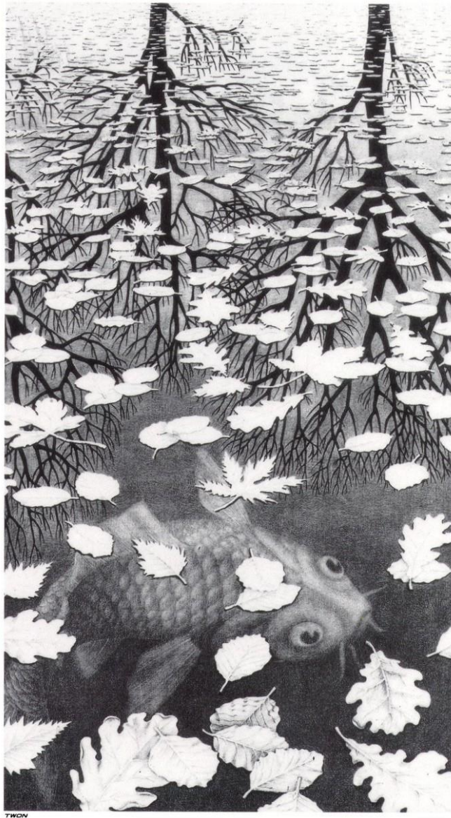
Three Worlds, M. C. Escher