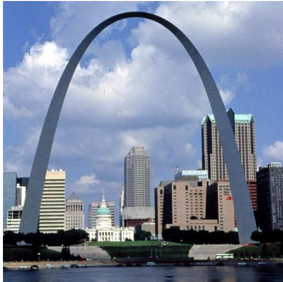
The St. Louis arch is in the shape of a hyperbolic cosine.

Hyperbolic functions are very useful in both mathematics and physics. You may have already encountered them in Math 118 or in Math 161. If not, here are their definitions: