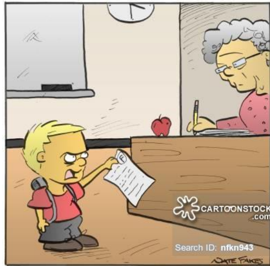
“Your grading scale needs to be calibrated.”