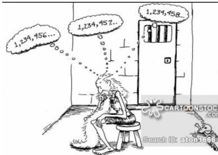
The Count of Monte Cristo