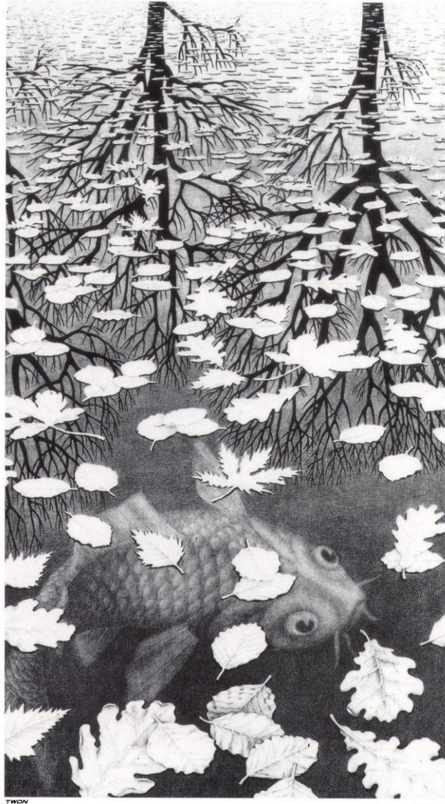
Three Worlds, M. C. Escher