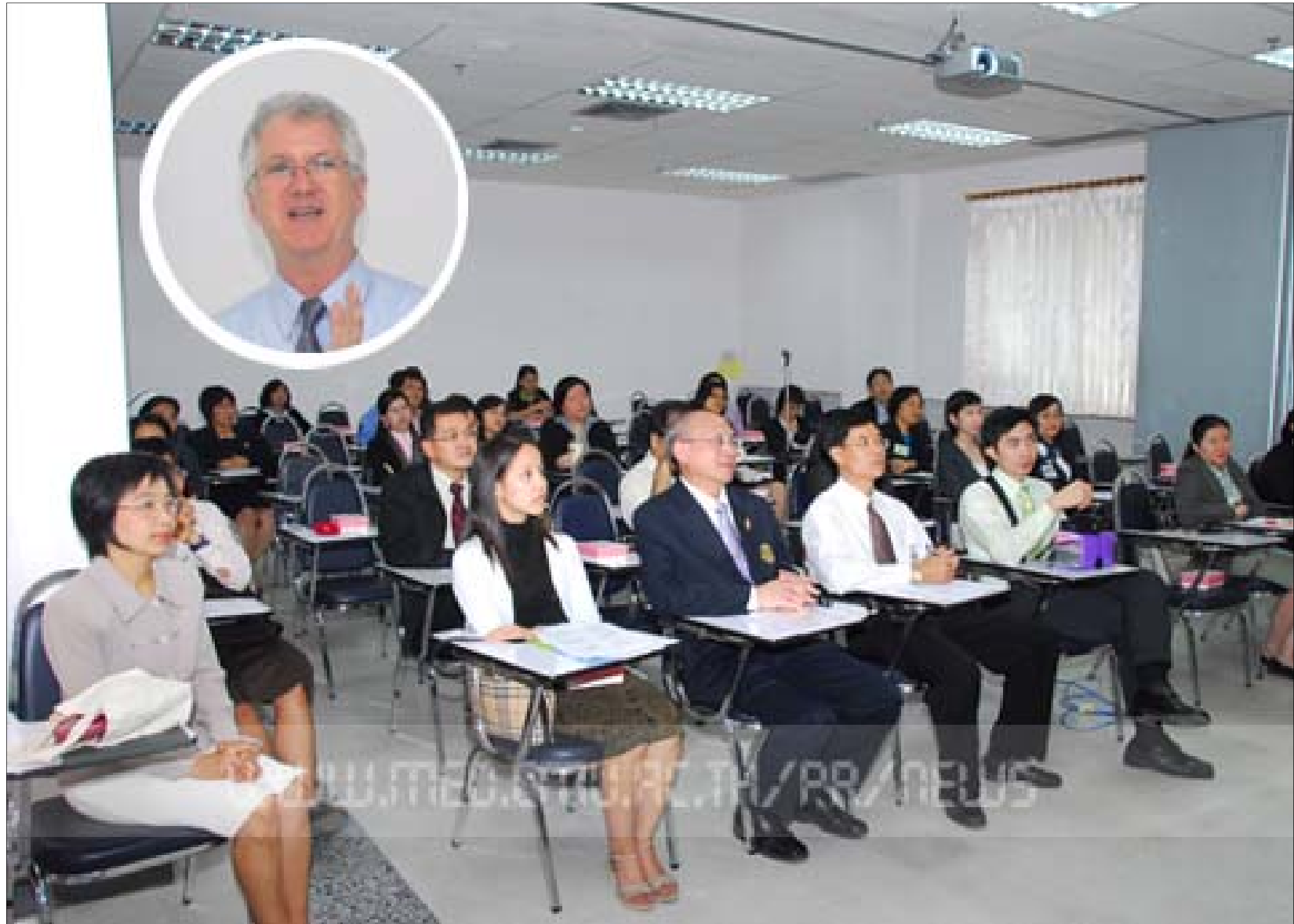
27 th December 2008 Chiang Mai University. Chiang Mai, Thailand