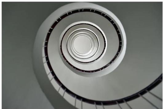
A spiral staircase in Nantes, France represents recursion — a sequence inside a sequence inside a sequence...